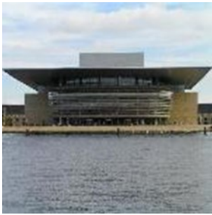
Copenhagen Opera House

When you have a little time off, you can enjoy our beautiful city: