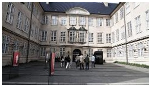
National Museum of Denmark